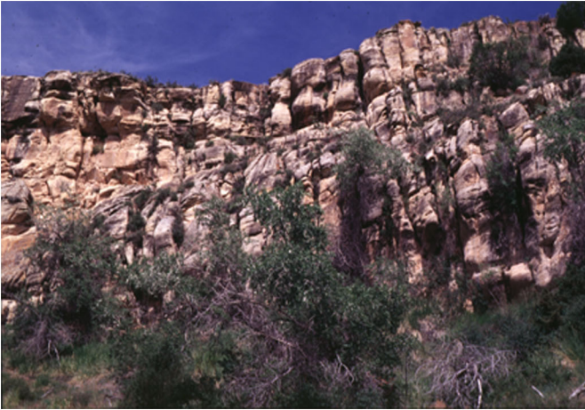
Habitat (S. Goodrich)