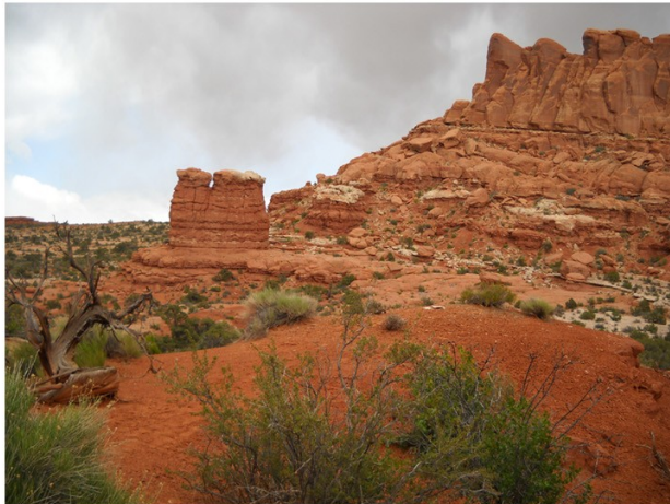
Habitat (W. Fertig)