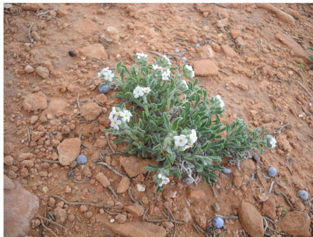
Closeups (W. Fertig)