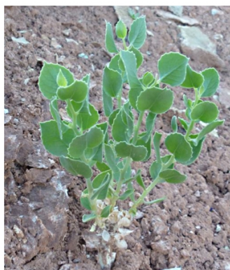
Closeup (B. Wellard)