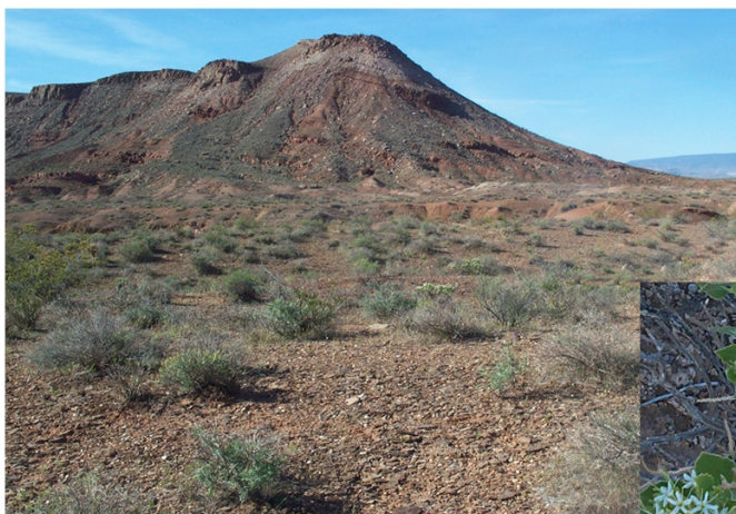
Habitat (A. Frates)