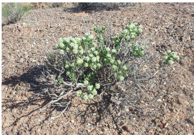
Closeups (A. Frates)