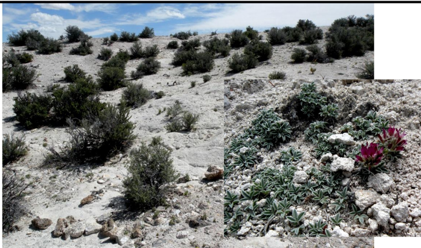
Habitat and inset (D. Roth)