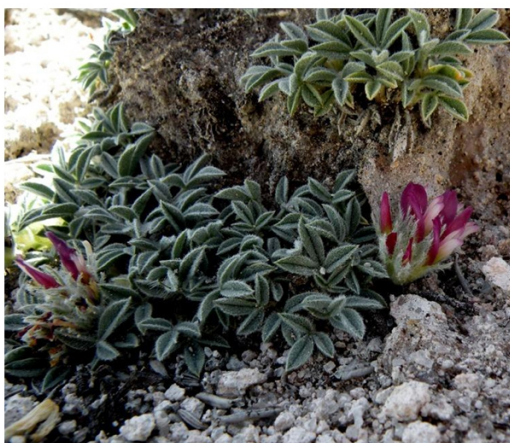
Closeup