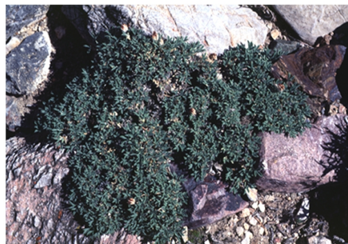
Closeups (A. Evenden)