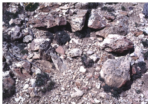
Habitat (A. Evenden)