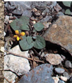
Closeup (D. Atwood, 1991 field guide)