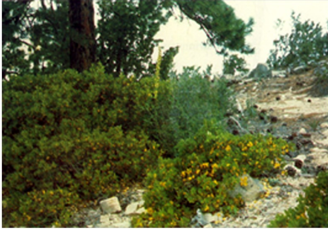
Habitat (S. Welsh, 1991 field guide)