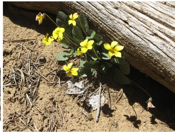
Closeups (W. Fertig)