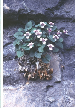
Closeup (K. Blaxland)