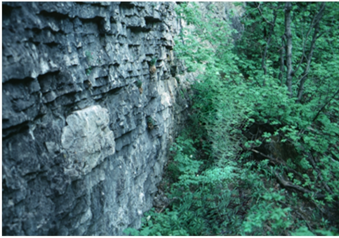
Habitat