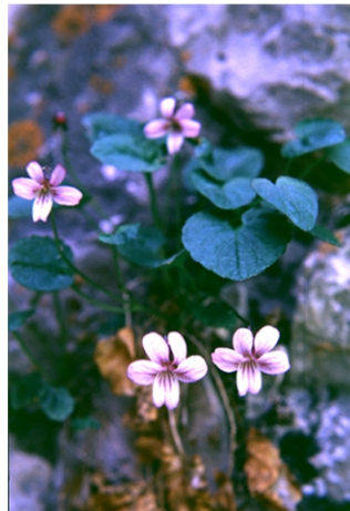
Closeup