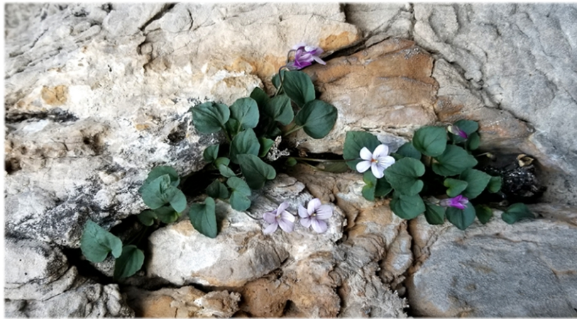
Closeup (B. Wellard)